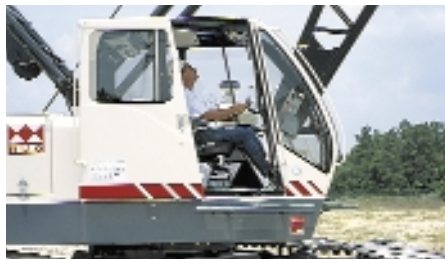
Environmental operator's cab

Max. Lifting Capacity: 60 tons (54.4 mt)