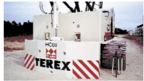
Hydraulic removable counterweight system