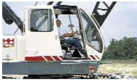
Environmental operator's cab

Max. Lifting Capacity: 50 tons (45.4 mt)