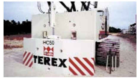
Hydraulic removable counterweight system