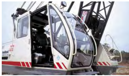
Environmental operator's cab