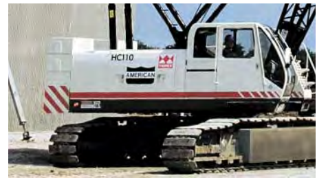
Hydraulic removable counterweight system